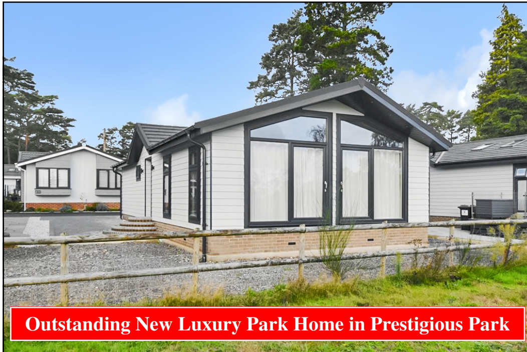
Outstanding New Luxury Park Home in Prestigious Park